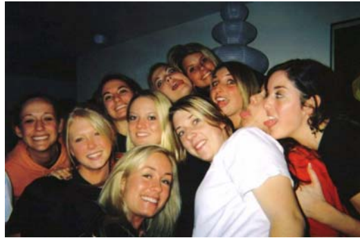
Sigma Kappa sisters goofing around at the sorority house!