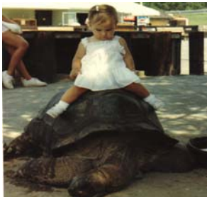
Right idea, wrong animal...

We're on the web! www.princesskelley.com