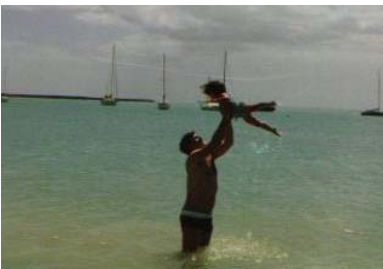
Me and my dad playing in the ocean together on a trip to Hawaii!

In classic princess style, I am a daddy's girl. Having said that, here is a short interview with the number one man in my life: