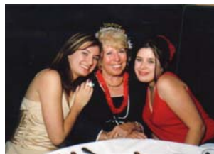
Me, My Grandma, and My Cousin at our New Years Dinner on the Ship!

hang out with because she is still 20 years old at heart! My cousin and I are not only close in age (she is 22), but also in personality. Needless to say, it was a fabulous "girls getaway."